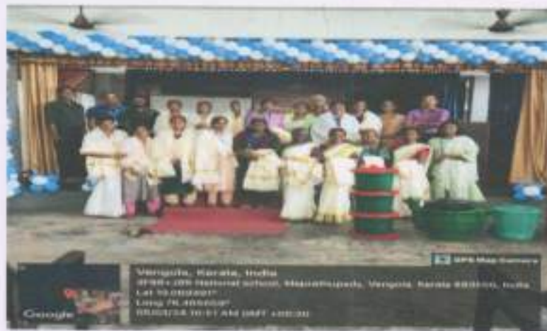
Honouring of Haritha Karma Sena