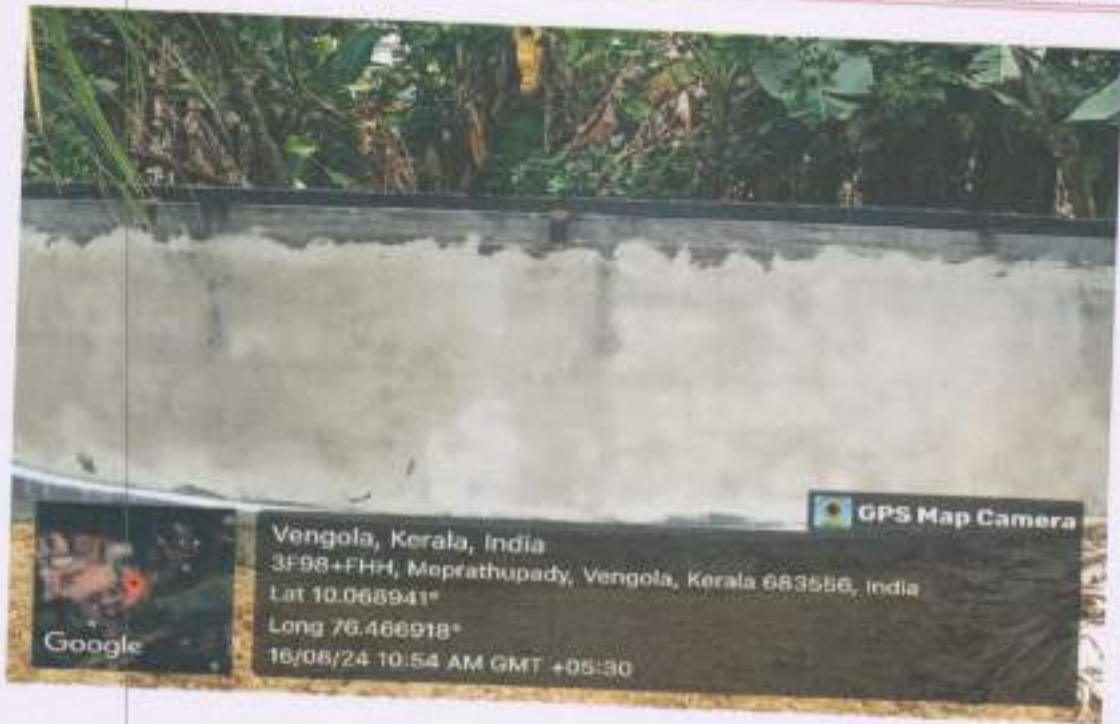
Rain Water Harvesting(Recharge Well)

Iqbal Square, Meprathupady, Vengola, Perumbavoor, Ernakulam - 683 556