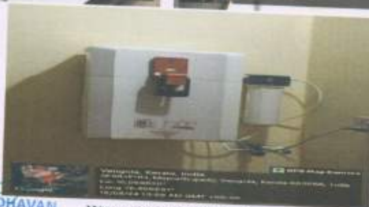
Water Purifiers in the Campus