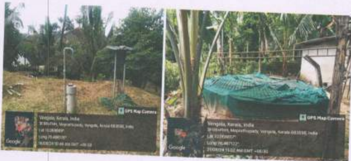
Ground Water System (Well & Bore well)