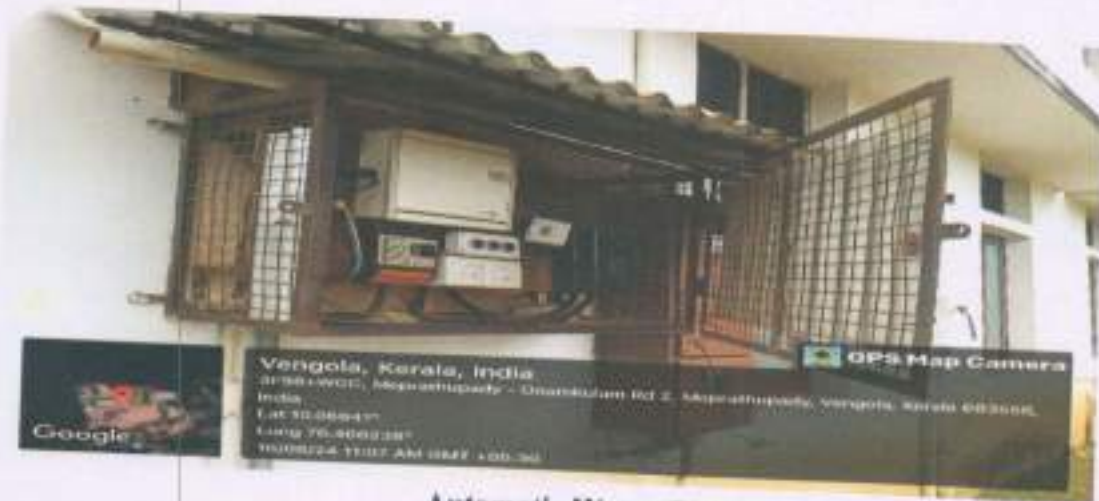
Automatic Water Controller

Iqbal Square, Meprathupady, Vengola, Perumbavoor, Ernakulam - 683 556