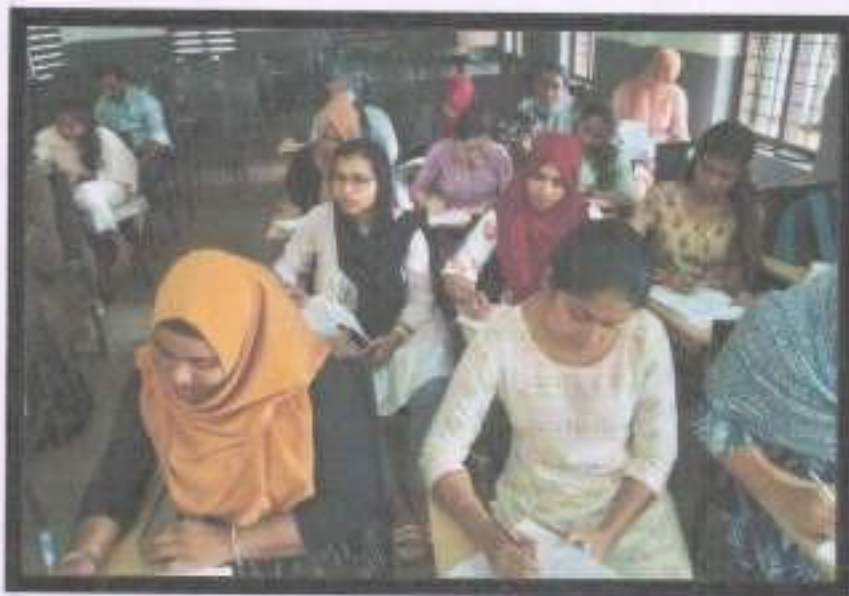
Feedback from Students