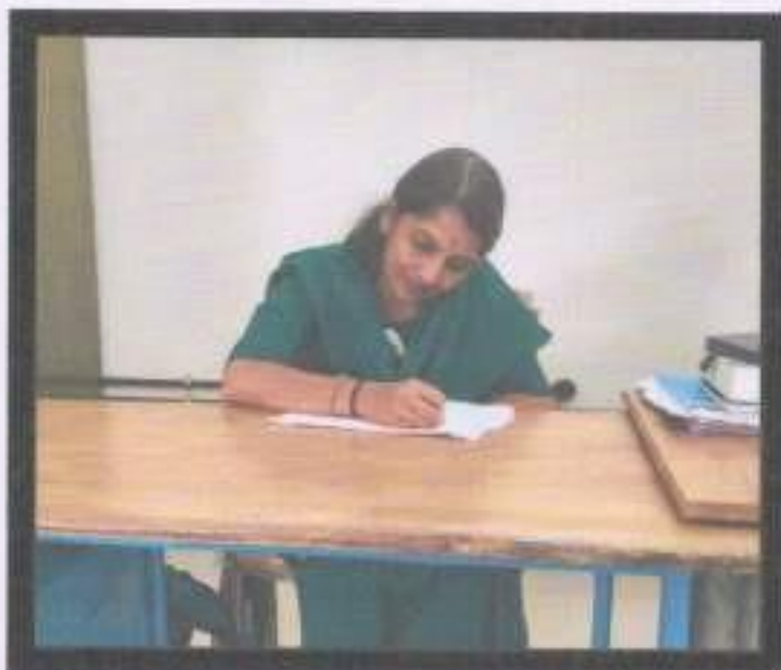
Feedback from Alumni

Iqbal Square, Meprathupady, Vengola, Perumbavoor, Ernakulam - 683 556