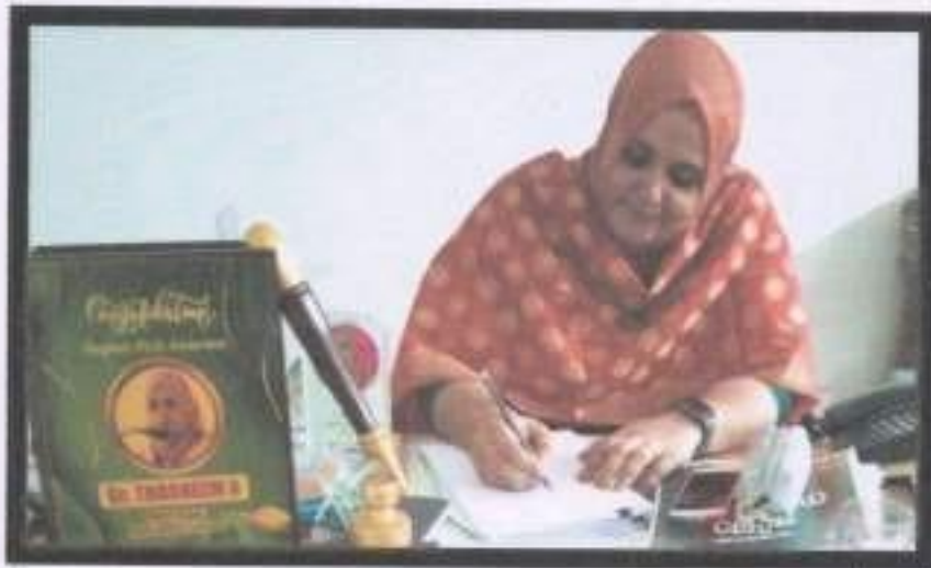
Feedback from Employer

Iqbal Square, Meprathupady, Vengola, Perumbavoor, Ernakulam - 683 556